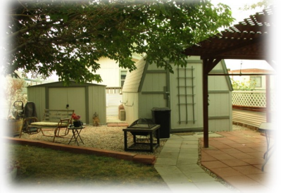
Please DO NOT Disturb Residents Call for Info and// or appointment. Thank You!