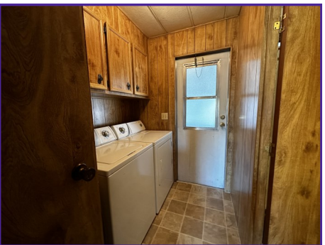
Information on this flyer is to be deemed accurate but not guaranteed. Buyer to verify all information. © 2004 – 2023 by White Knight Enterprises. All rights reserved