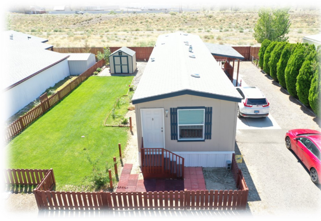
CONESTOGA MOBILE HOME COMMUNITY #4 WADSWORTH NV 89442