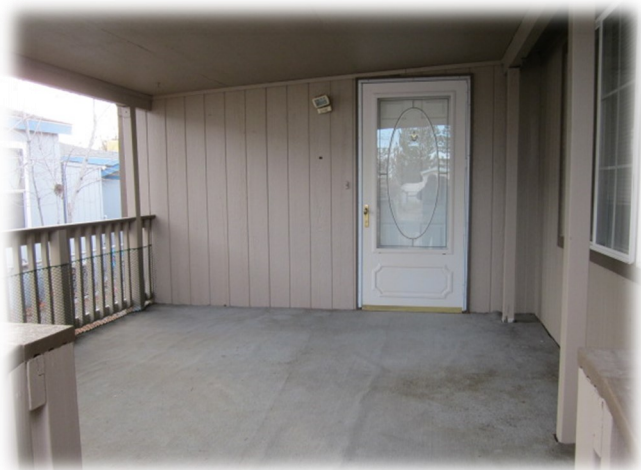
120 FARMINGTON WAY; FERNLEY NV 89408